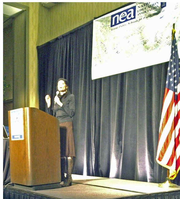
NEA Vice President, Lily Eskelsen

I appreciate the opportunity I was given in being able to attend the NEA Pacific Regional Leadership Conference. I would be happy to share more details about the conference with interested teachers.